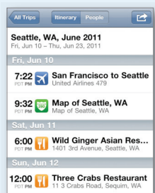
Create itineraries for travelers in an instant