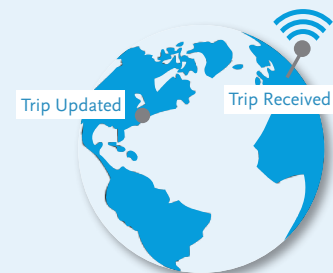
Keep travelers in the know, on the go

The Triplt for Business solution includes all the functionality of Triplt Pro. Triplt Pro is a premium service that acts like a personal travel assistant that keeps you constantly informed on flight status, alternate flights, and more; keeps you organized with all your frequent traveler information in one place; and can save you money with alerts on flight refunds.